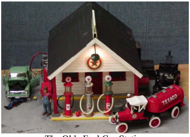
The Olde Fuel Gas Station