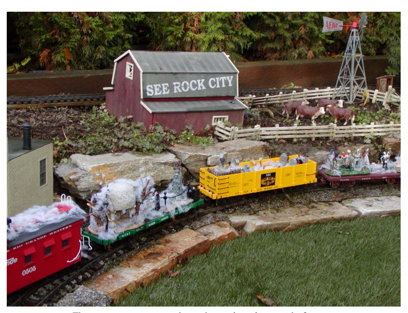
The cows seem unconcerned as a ghost train cruises past the farm.