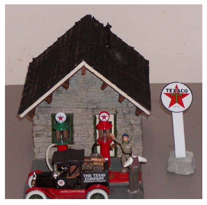
Gas Station (Texaco)