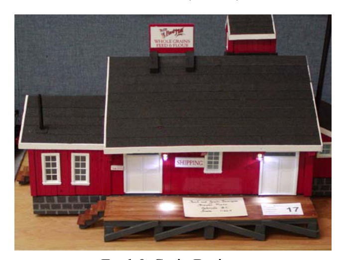
Feed & Grain Business