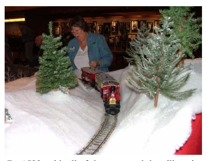
By 1500, with all of the snow and the village in place, ballasting of the tracks was started followed by a "slow" test run of the train to ensure that there were no clearance issues with trees, buildings or snow drifts.