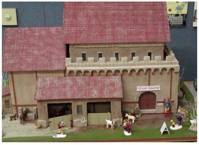
Hindsberg Castle (Medieval)