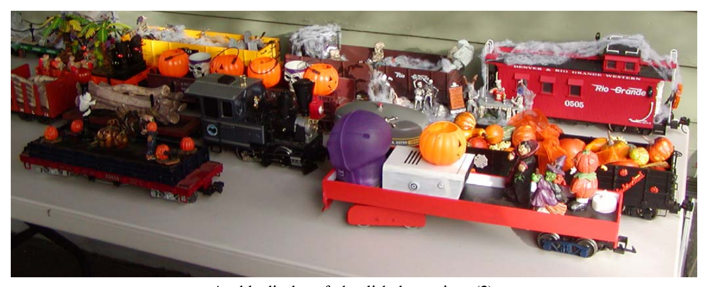
A table display of ghoulish decorations (2)