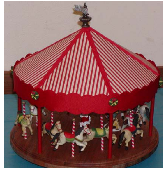
A well crafted "Carousel" using a "Lazy Susan" as a base.