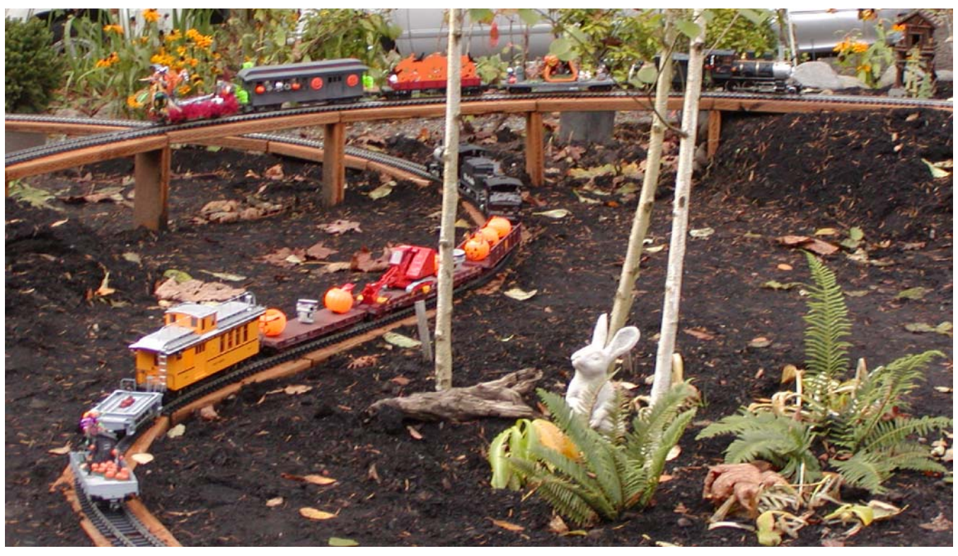
Two of the Ghost Trains on the western loop