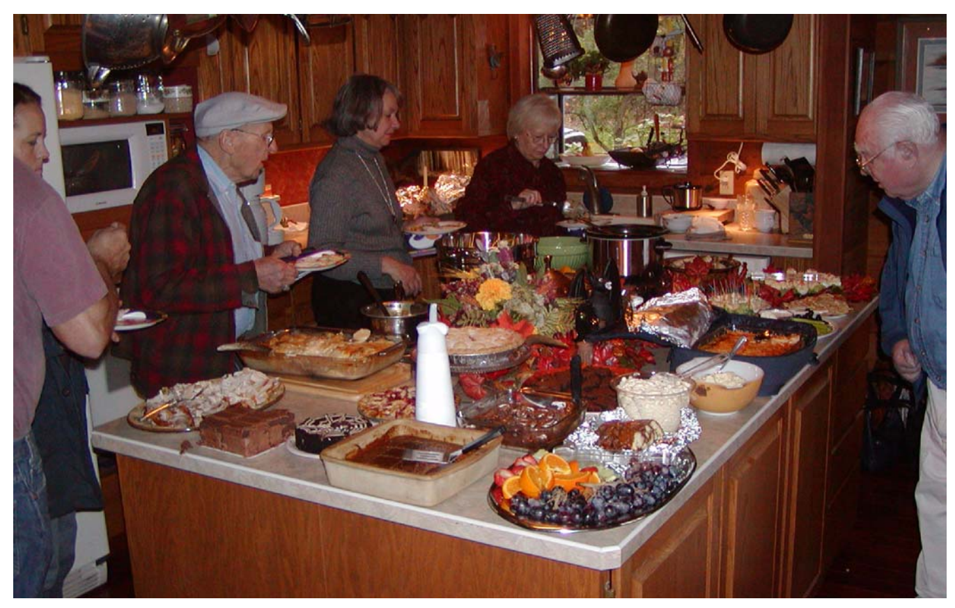
The food was plentiful and wonderful at the Ghost Train event