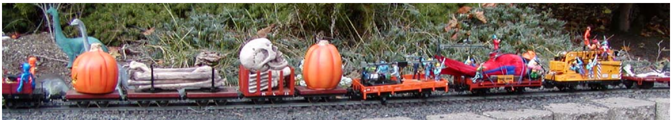
Ghost Train part 2