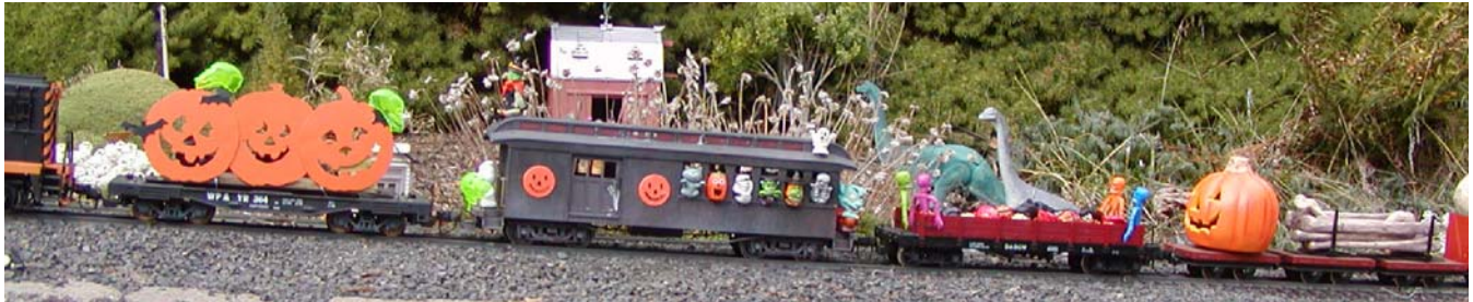
Ghost Train part 1

the potluck provided by the members and guests ensured plenty of food. Each member was encouraged to bring a “ghostly” decorated car or train to run on the railroad.