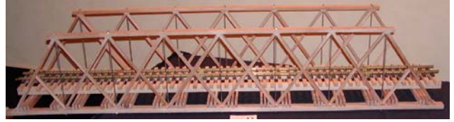
A beautiful truss bridge