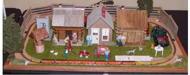
A diorama of a garden railroad with a Z-scale train as the railroad feature.