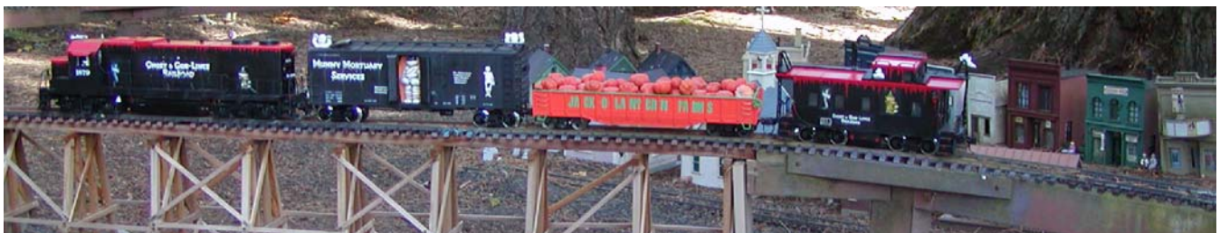
The train of the “Ghost and Gob-Lines Railroad” makes its way over the trestle