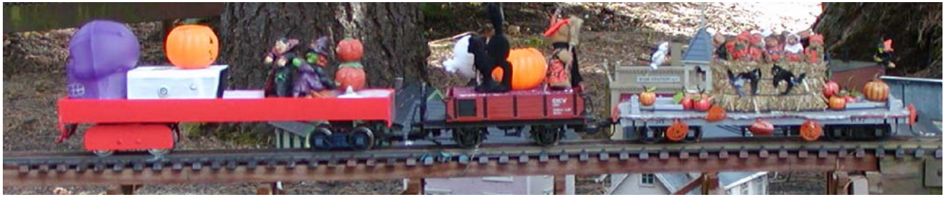
An open motor car built from scrap box parts pulls a small train of Halloween celebrants