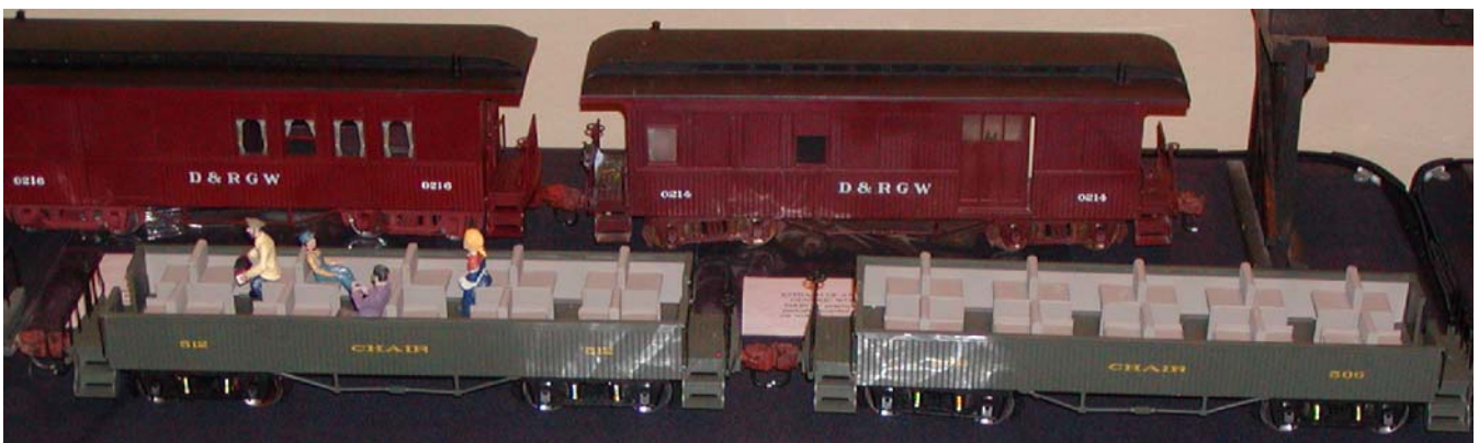
Kit Bashed/Scratch Built Cars