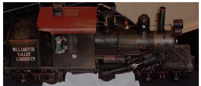
Kit Bashed and Weathered Locomotive