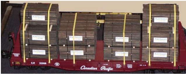
Kit Bashed car: CP Lumber Car