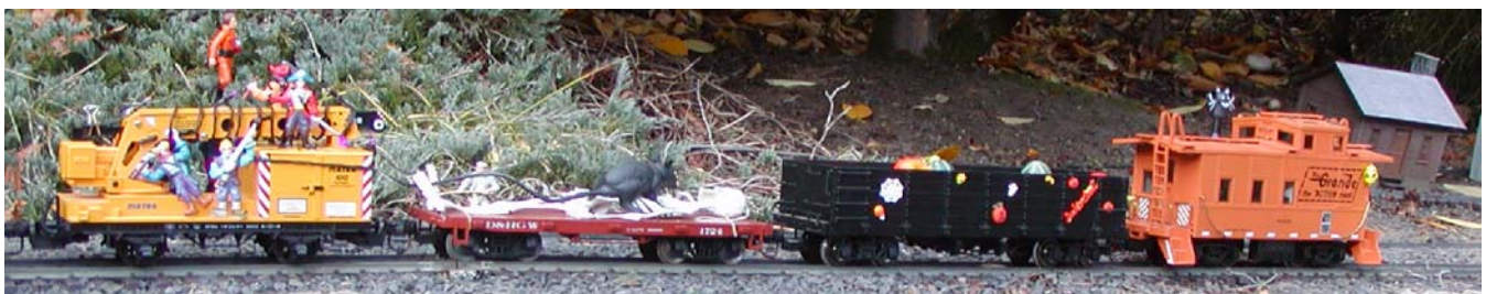
Ghost Train part3