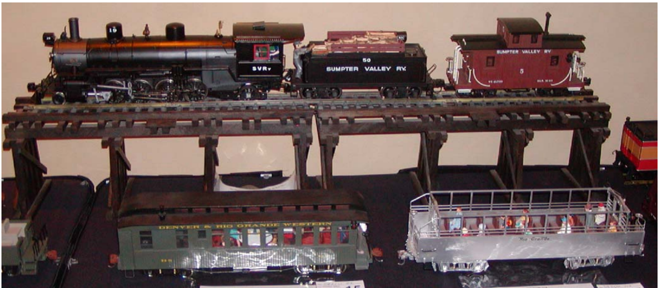
Kit Bashed/Scratch Built locomotive and cars