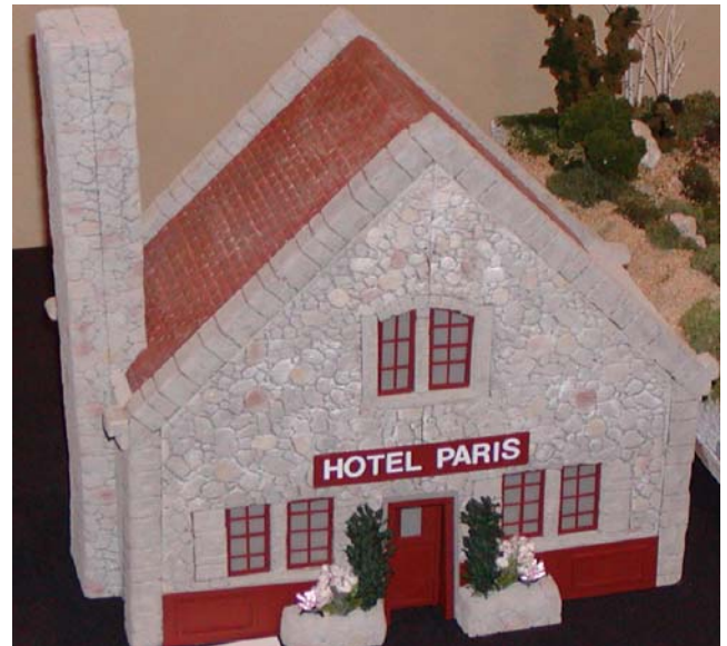
Small hotel made from foam