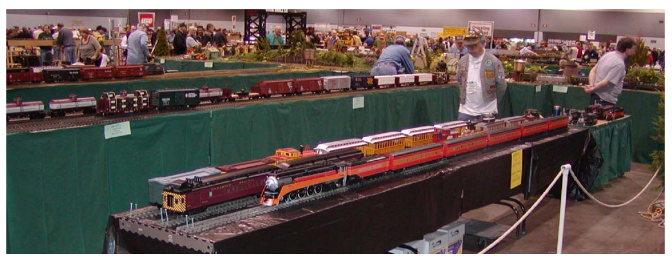
Some beautiful trains on display