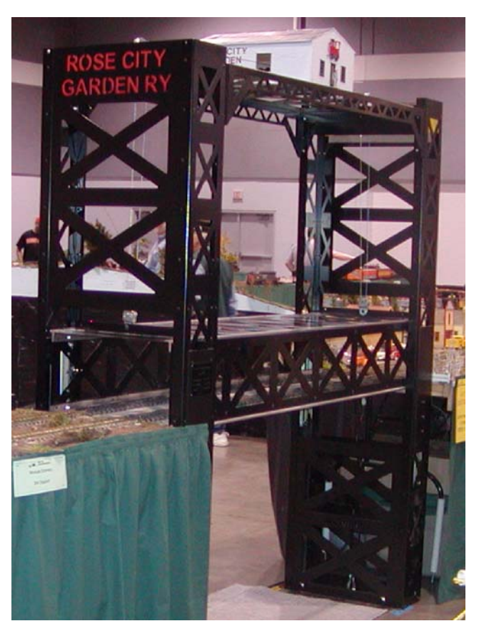
Lift bridge in lowered position