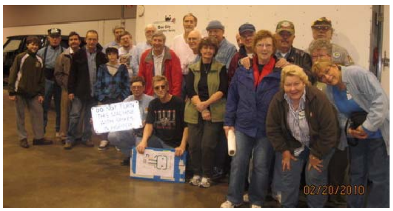
The "tear-down" crew

Our club has so much to be grateful for with the resources, unity and friendship that we share. I am proud of what we have accomplished, and the many goals we have reached together to make the show a success.