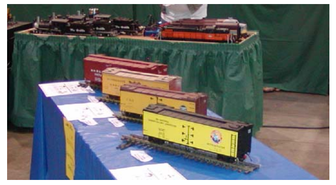
A display showing some the various scales within G-scale and various locomotives