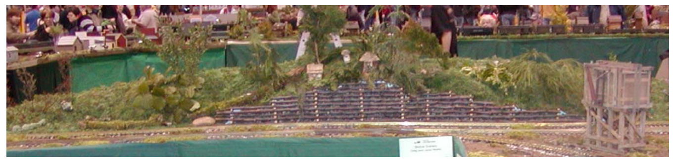
Module with a log retaining wall by Greg Martin