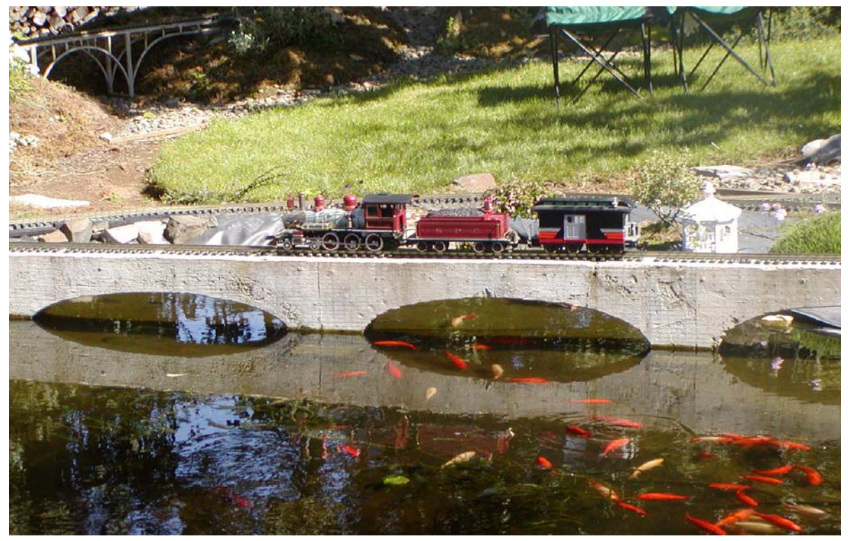
Penny Walker's Locomotive Traverses The Great Fish Pond At The Wadley's Railroad.

It was a beautiful day at the Oregon coast to visit Glen & Judy Wadley's railroad. Glen has built a large railroad around a complex water feature. An upper pond cascades through a short stream to the larger fish pond. The basic design of the railroad is a "figure 8", but since the railroad loops through a tunnel and various cuts and valleys, the design is not readily apparent. The food was great and the Wadley's were gracious hosts. We thank them for sharing their house and railroad with us.