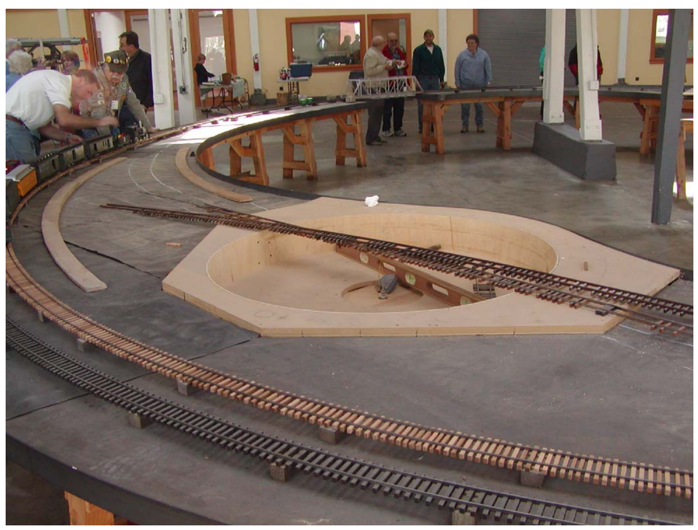
A turntable in progress. Also shown is the construction of the road bed. Gravel ballast has not yet been added to this section of the road bed.