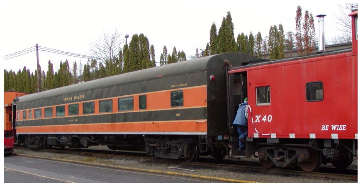
Coach and second caboose