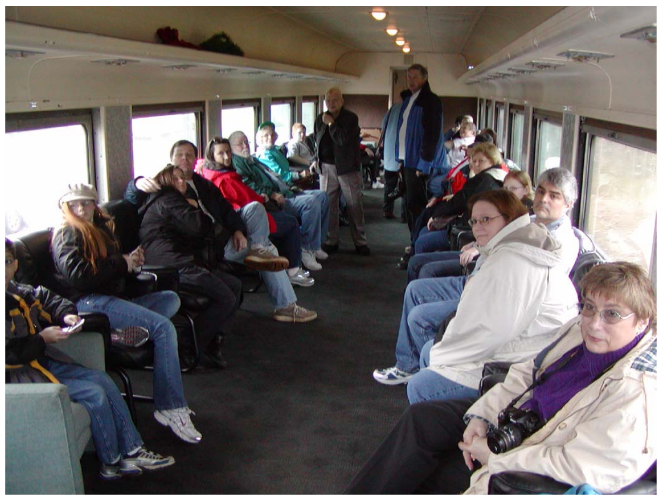
The coach passengers are ready for the trip