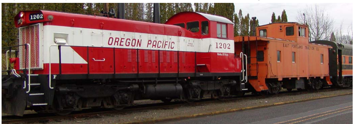
SW1200 locomotive and first caboose now ready for the railfan trip

The train was pushed/pulled by the railroad's newest locomotive, a beautifully refurbished EMD SW1200. There were three cabooses on the train for those that wanted the experience of riding in a caboose. Most of the passengers opted for the more comfortable and congenial coach.