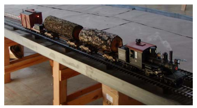
Those must be "old growth" logs being pulled by Mike Greenwood's "Climax"