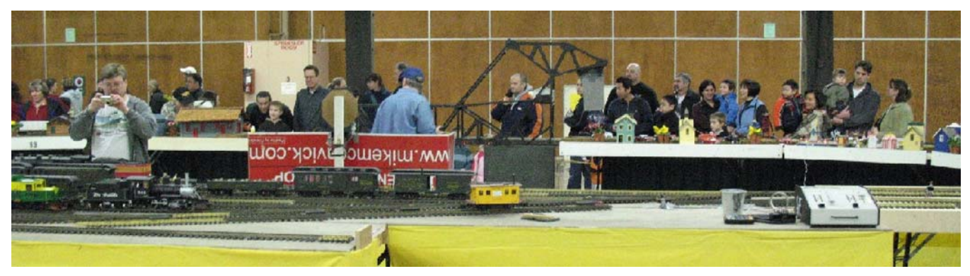
A crowd gathers to watch the Bascule bridge lift.

A recap and evaluation of the GTE operation was held at General Tool on February 23rd. The discussion included some of the following points to be considered for future operations: