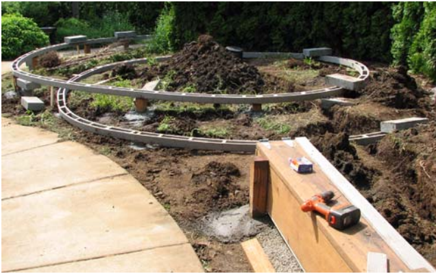
Concrete posts to support the sub-roadbed