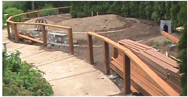
The fence railings are installed. Notice the several yards of soil that have been installed