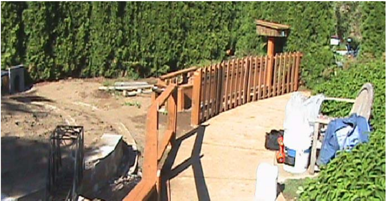
Installation of the Fence Pickets