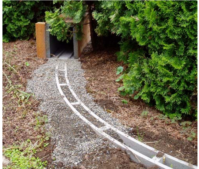
First ballast of sub-roadbed