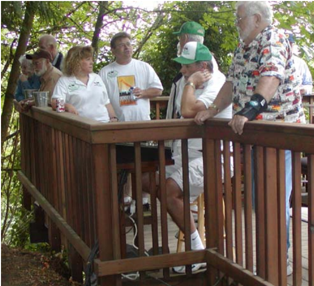
The control center