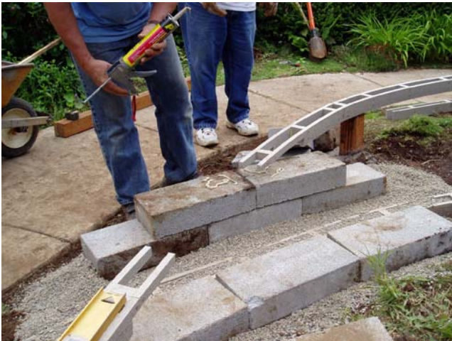
Constructing the bridge abutments