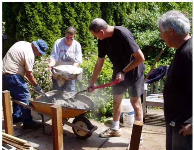
Plenty of concrete holds the fence posts