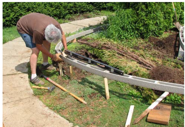
Check the grades

The Oregon Garden is planning a grand opening of the railroad on Tuesday October 20th. Details will be sent in a later email. The pictures that follow show some of the construction that took place since the article written for the July newsletter. More on track laying, plantings, train running next issue.