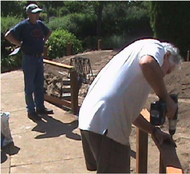
Constructing the fence railings after soil is in