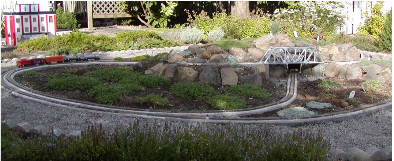
The 1/64th scale microgarden (S-Gauge)