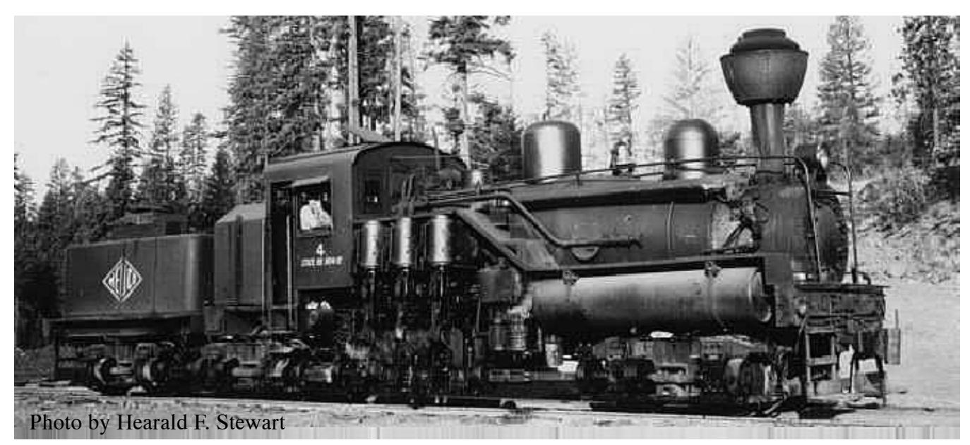
Medco Locomotive No. 4 in the Woods

The No. 4 began and ended it's career in the forests of the Cascade Mountains around the town of Butte