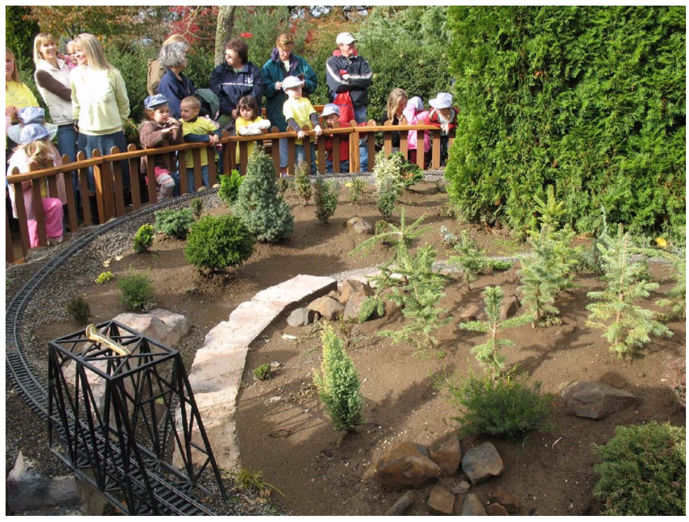
A small crowd at the dedication. Note the "golden spike" laying on top of the bridge.

The design is intended to be a garden with a railroad feature in it. As a result, the single loop railroad is intended to operate with a minimum of oversight. However, recent experience has shown some supervision is needed because leaves and some vegetation falling on the track can cause derailments. Congratulations to both clubs for creating a nice public display.