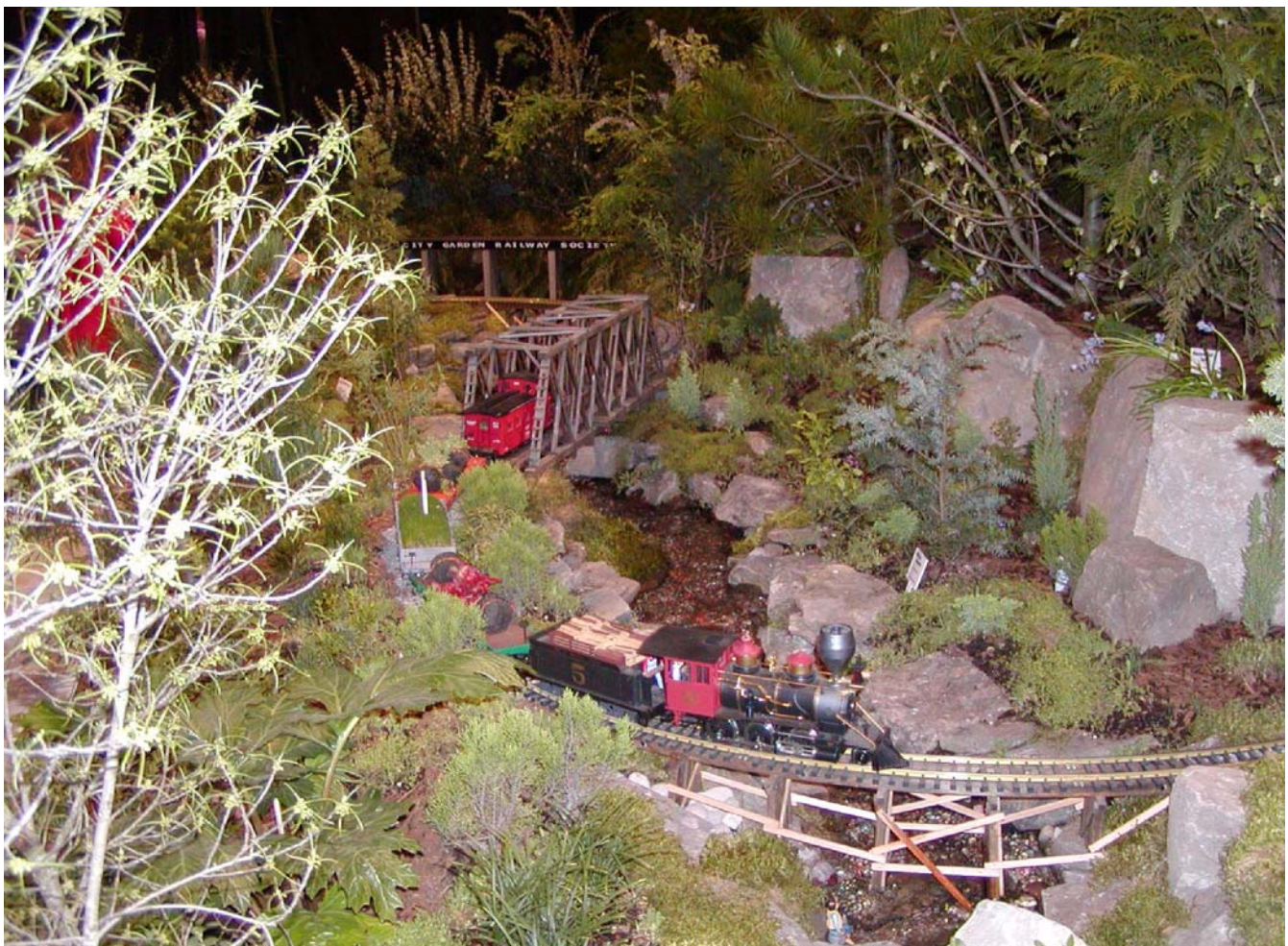
A Train Runs Through It