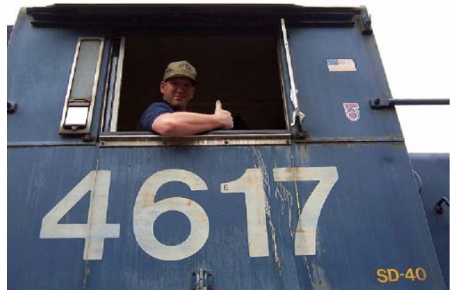
A railfan, under the supervision of a CSXT Engineer, during a rare tour of CSXT 4617, which used to wear C&O livery.