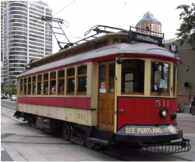
Portland Vintage Trolley

• Railway history— Many defunct and a few operating railroads have a historical society dedicated to preserving the railroad’s past history. The historical society’s records and libraries are a great source of information if a modeler wants to use a particular railroad as the theme and example for the model operation.