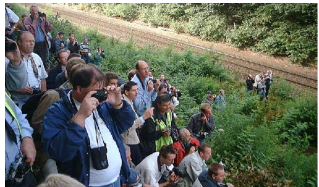
Railfan photographers awaiting a special train in Belgium

• Railroad photography— Railroad companies sometimes dislike railfans, considering them a nuisance. Because of terrorist activities world wide, the security people often now make photography difficult. The companies also acknowledge that railfan’s presence can sometimes make the railroads safer, since they typically know what is normal behavior and can detect criminal behavior, or something that appears to be abnormal.