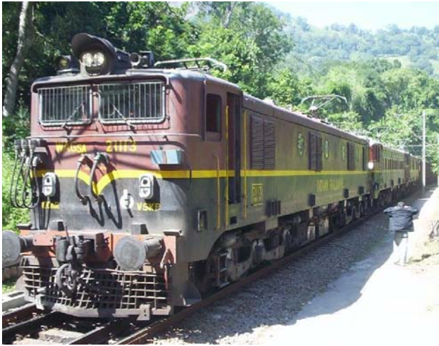
A WAG-5 in Araku Valley near Vizag, India – a paradise for trainspotters

• Trainspotting —“Trainspotters” make an effort to ‘spot’ all of a certain type of rolling stock. This might be a particular class of locomotive, a particular type of carriage or all the rolling stock of a particular company. To this end, they collect and exchange detailed information about the movements of locomotives and other equipment on the railway network, and become very knowledgeable about its operations.