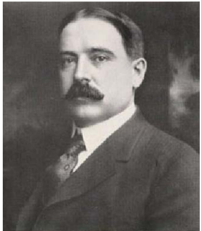
Richard Warren Sears

founder of Sears, Roebuck and Company with his partner Alvah C. Roebuck. He is considered to be one of the great American promotional geniuses.