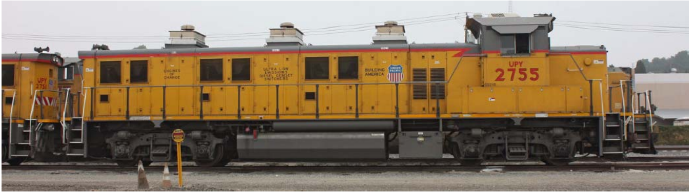
Ultra Low Emissions Diesel Genset Switcher