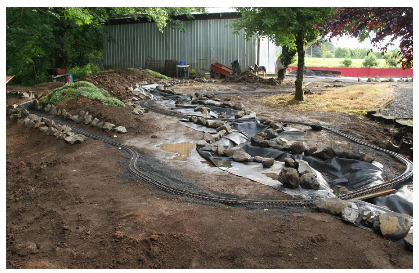
Track is set in place. Much landscaping in the future.