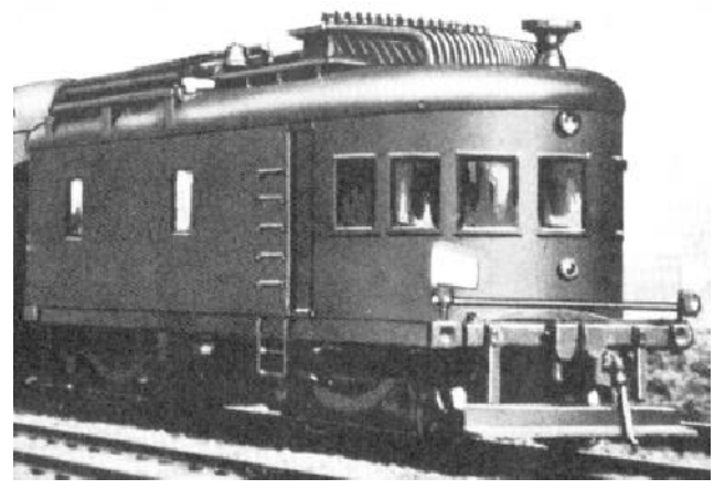
GE/Ingersoll-Rand Oil-Electric of 1924 300 hp.

Although it was strongly committed to the steam locomotive, ALCO produced the first commercially successful diesel-electric locomotive in 1924 in a consortium with General Electric (electrical equipment) and Ingersoll-Rand (diesel engine). This locomotive was sold to the Central of New Jersey, and subsequent locomotives were built for a number of railroads including the Long Island Rail Road and the Chicago & North-Western Railroad.