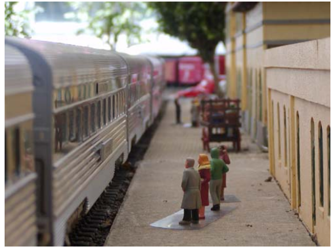
Train time at the Creston Station

Also new this year was that all of the remote control switches operate from the switch panel.