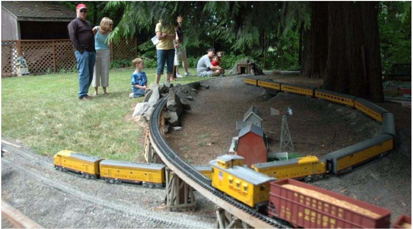
Over, under, and around; plenty of RR action here