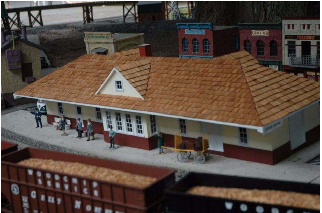
A finely detailed RR station