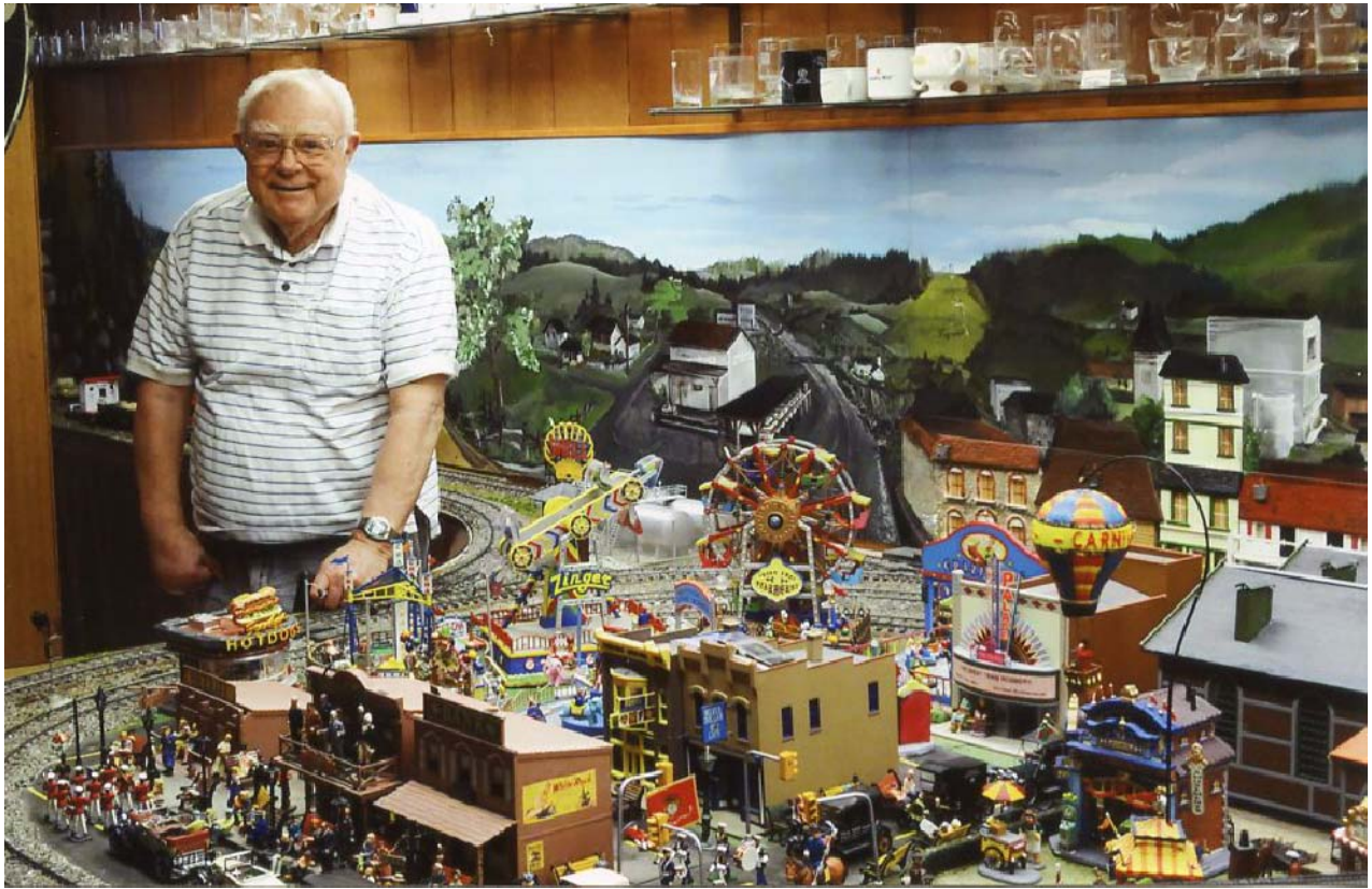
The carnival came to Partytown.