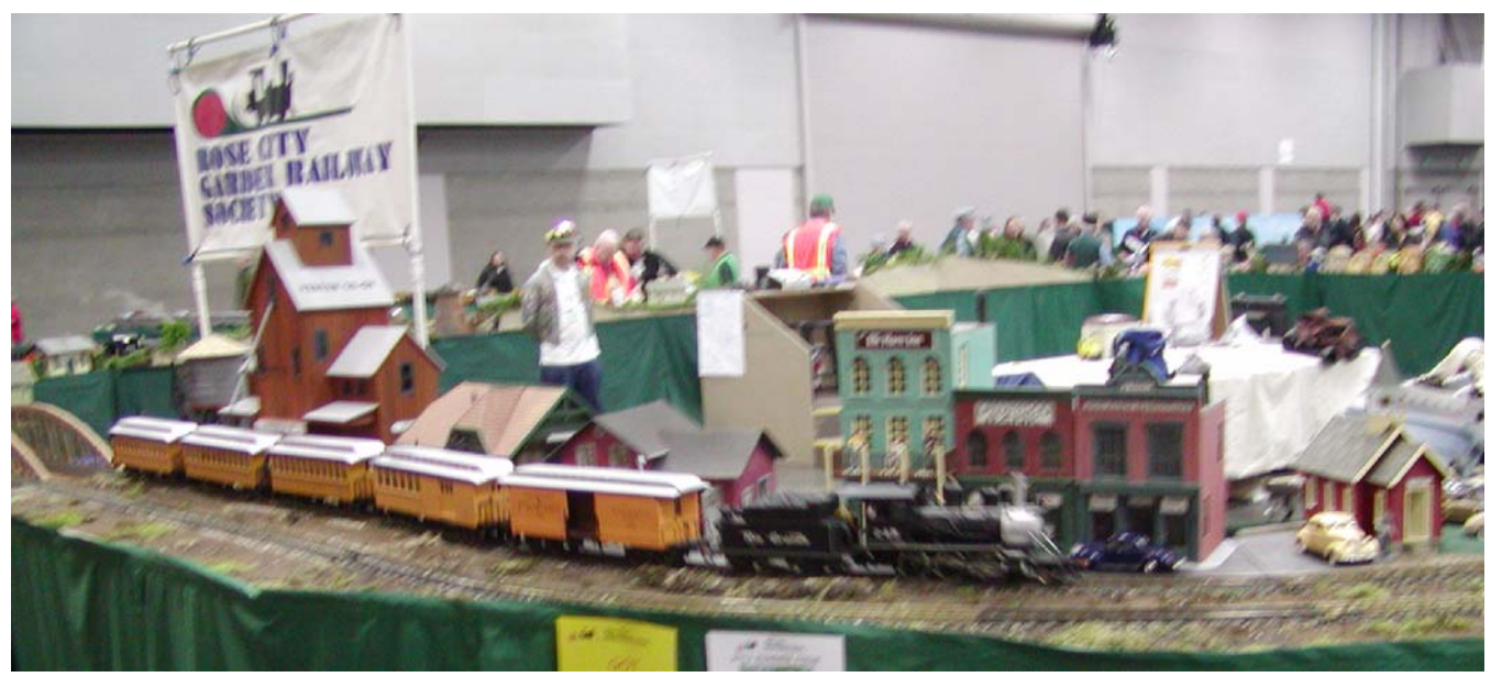
Bill Dippert's Rio Grande passenger train makes an extended run.

How do you heat the boiler? How do you control it? How often do you have give it fuel and water?