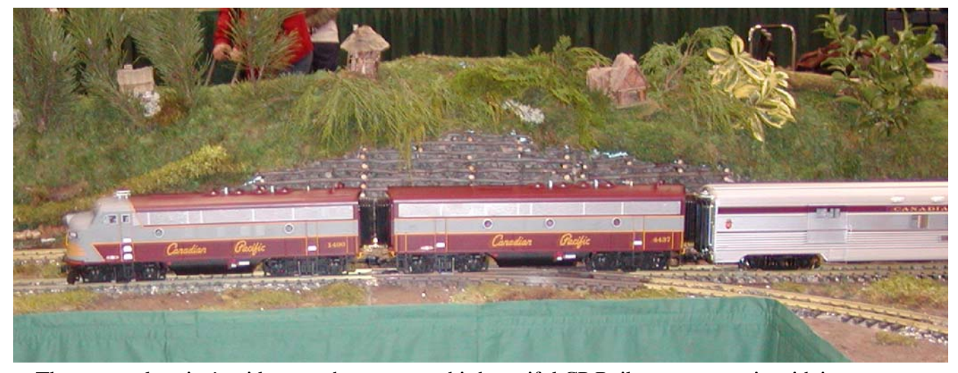
The camera lens isn't wide enough to capture this beautiful CP Rail passenger train with its seven cars. This train is a very heavy and nicely detailed USA Trains model. It requires a minimum of two locomotives and large radius track to run. It take nearly seven amps of track power to operate this train.