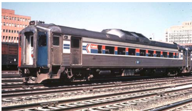
Amtrak Budd EDC-1, Chicago 1974