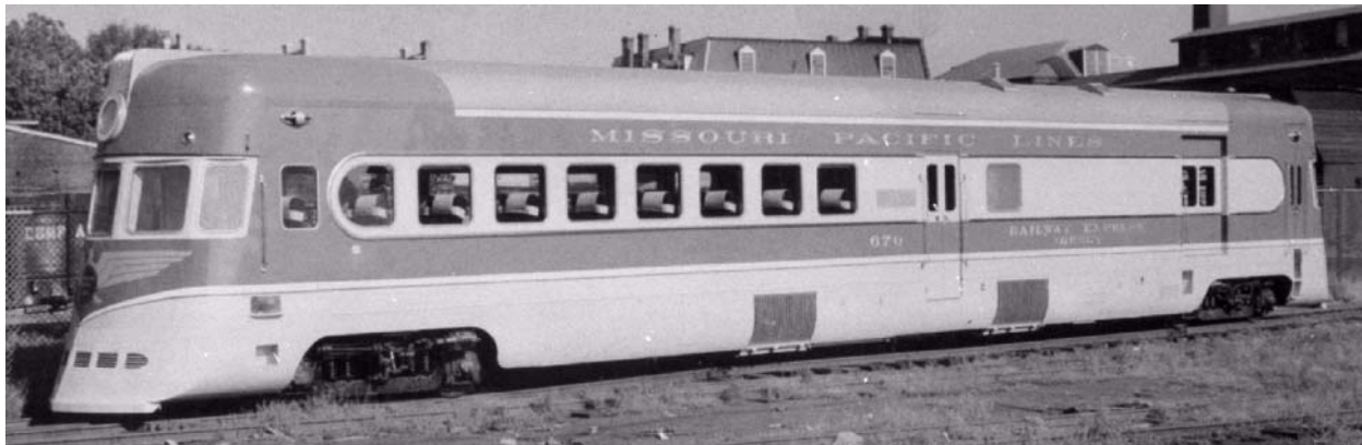
Missouri Pacific Lines bi-directional "Eaglette" circa 1942 By American Car & Foundry