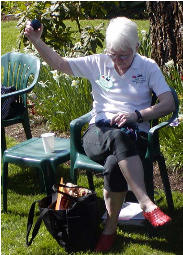
It was a nice day to tend to her knitting