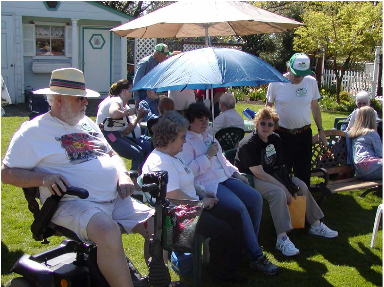
A great day for a potluck, watching trains and chatting with friends.