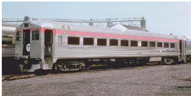
MBTA (Boston) Budd RDC-1

made for tanks. They were a modest investment at $160,000. RDCs never reached their full potential because they were caught in the time frame when railroads were cutting back passenger service.