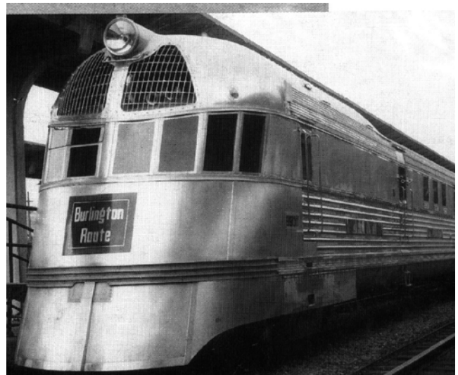
1934 Pioneer Zephyr No. 9900

Time stood still on the development of the rail car because of World War II. The most spectacular success of the development of equipment for some branch lines was the CB&Q “shovel nose” Zephyrs by Budd. However, their popularity demanded that these Zephyrs were used more often on mainlines.