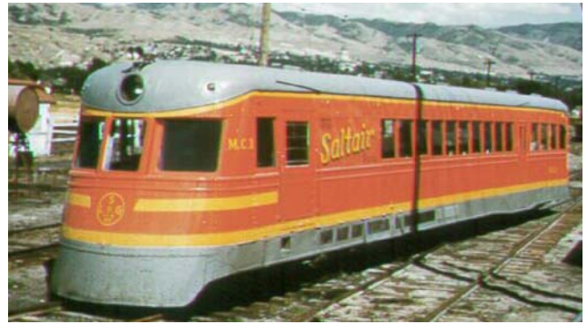
Salt Lake Garfield & Western M.C.3 at Salt Lake City, UT circa August 1952 by American Car & Foundry