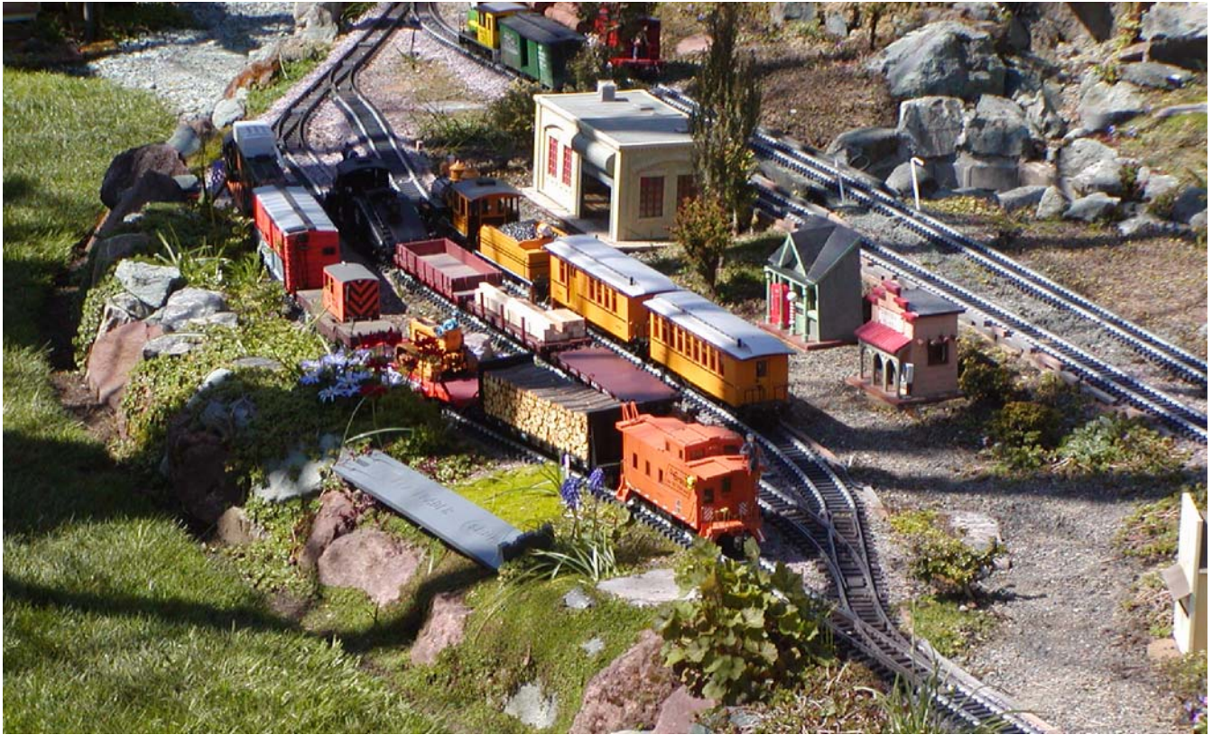
The trains are quiet during lunch