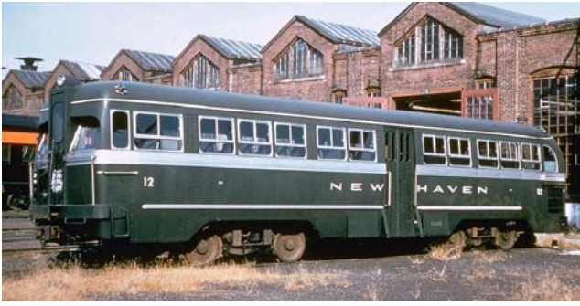
Newhaven Railroad motorcar by American Car & Foundry