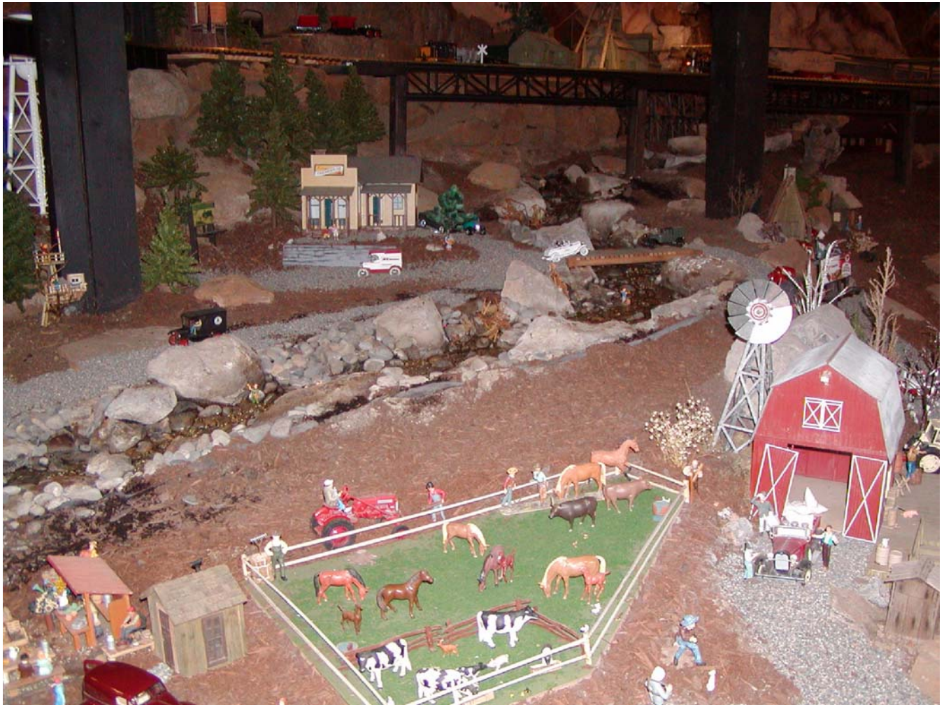
A busy day at the Joe Chesney Farm