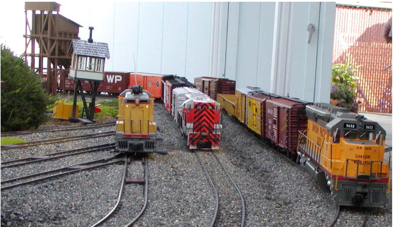
Trains awaiting train orders in Jerry Chapman's switch yard