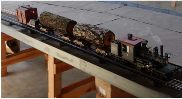
Those must be “old growth” logs being pulled by Mike Greenwood’s “Climax”