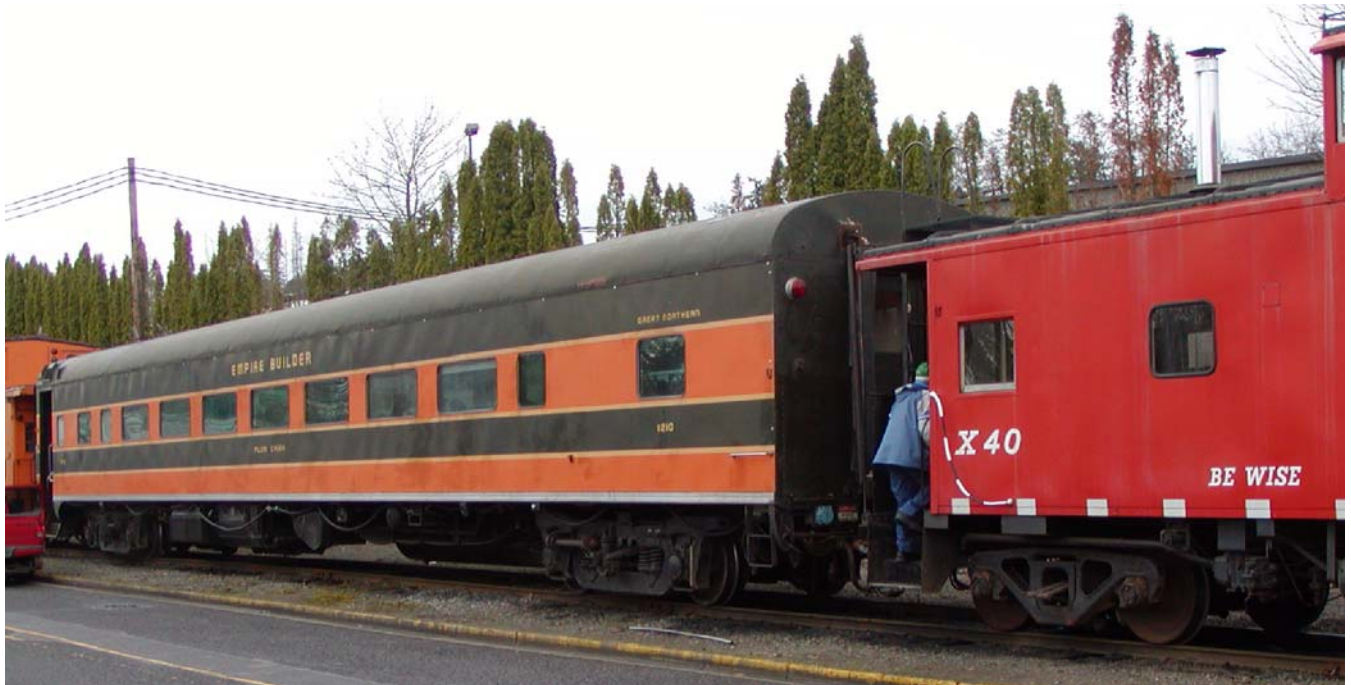
Coach and second caboose