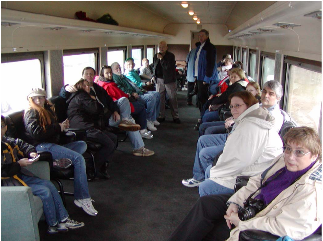
The coach passengers are ready for the trip