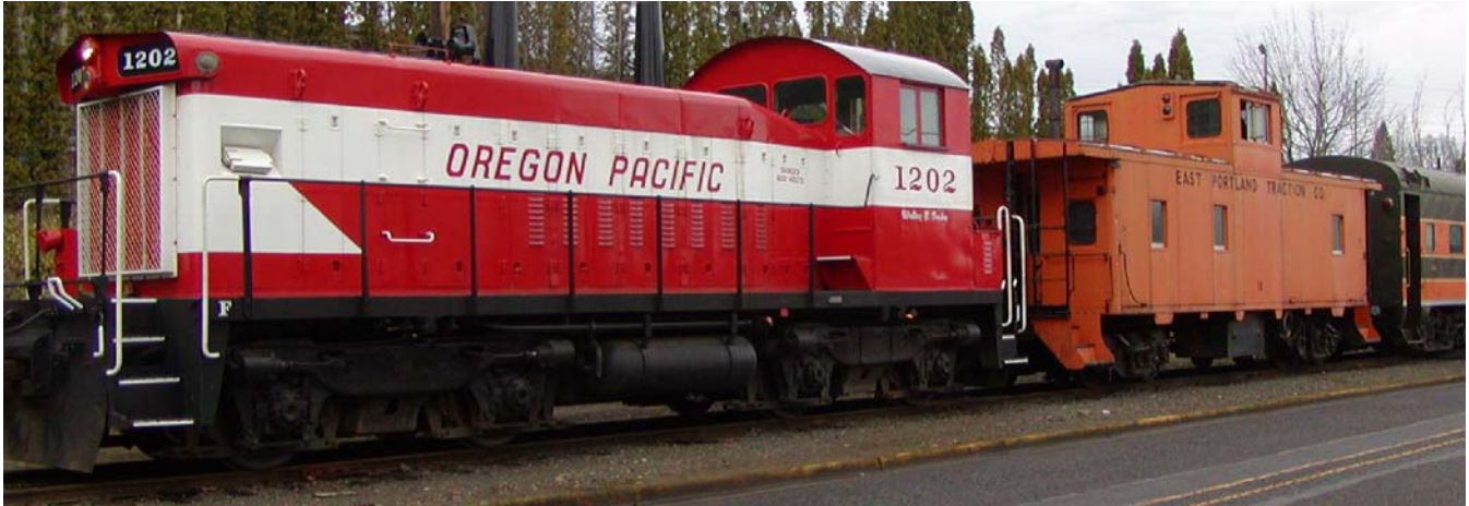
SW1200 locomotive and first caboose now ready for the railfan trip

The train was pushed/pulled by the railroad's newest locomotive, a beautifully refurbished EMD SW1200. There were three cabooses on the train for those that wanted the experience of riding in a caboose. Most of the passengers opted for the more comfortable and congenial coach.